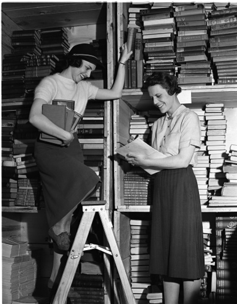
University of Michigan Alumnae Book Sale, May 1938.